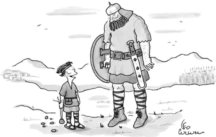
"Instead, let me be your investment advisor and get you eleven-per-cent return, year in and year out, regardless of market conditions."

© 2008 The New Yorker Collection from cartoonbank.com. All Rights Reserved.